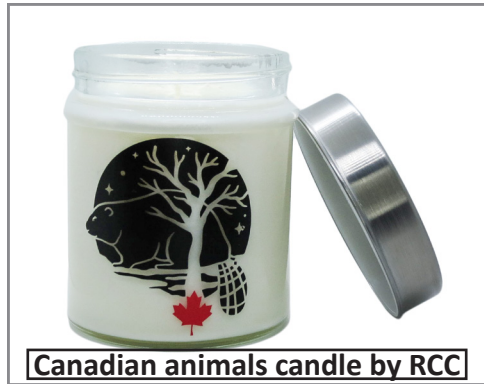
Canadian animals candle by RCC

When I bought Royal Canadian Candles, I had one burning desire...to make people's day a little brighter.