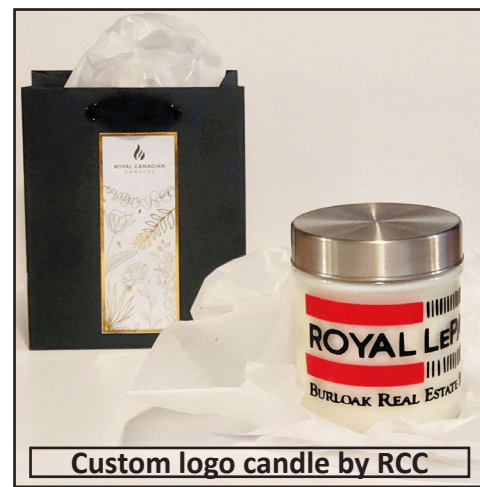
Custom logo candle by RCC

To see our online selection or for info: royalcanadiancandles.com .